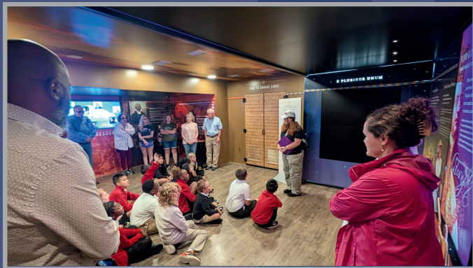
Sacred Heart School students and teachers tour the VA250 Mobile Museum.