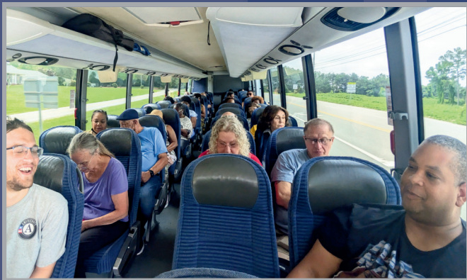
DMFAH hosted a bus trip to Sharswood Plantation for their annual Juneteenth Celebration.

DMFAH enjoyed partnering with over 30 organizations, institutions, and individuals in FY25, including Opera on the James, the Danville Public Library, Danville and Pittsylvania County Head Start, Danville Public Schools, Pittsylvania County Public Schools, Martinsville/Henry County Public Schools, Sacred Heart School, Averett University, Our History Matters, Pittsylvania Historical Society, Virginia Museum of History & Culture, Virginia Humanities, Our History Matters, The Institute for Advanced Learning and Research, the City of Danville, Dan River Region Nonprofit Network, Longwood University, VA/NC Scottish Society, Danville Department of Economic Development and Tourism (VisitSOSI), VA250, Friends of the Old West End, Opera on the James, Danville Historical Society, Danville Police Department, Sharswood Plantation, the Pittsylvania Historical Society, the Gabriella Garden Club, the Chatham Garden Club, the Garden Club of Danville, and the Wednesday Club.