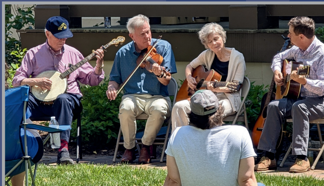
The New North Carolina Ramblers play at DMFAH during the Friends of the Old West End Porchfest.